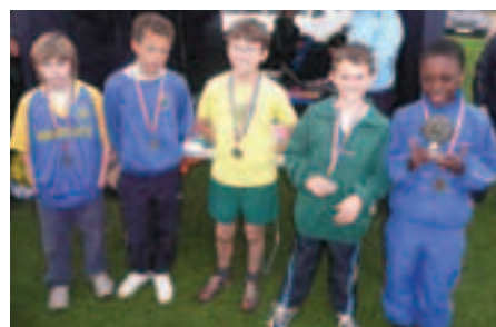
Top 5 boys, Cross-country 2008.

Our competition calendar is fully booked this year (see page 7) with many events ensuring that the winners of finals could represent Croydon at the London Mini games in July 2009.