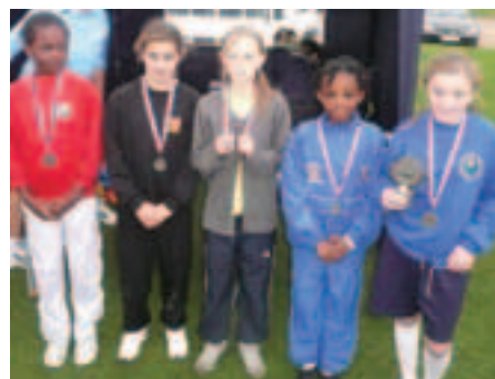
Top 5 girls, Cross-country 2008.

run at their own grounds and on a timed basis. This meant that he achieved the greatest number of children running overall with over 90% of participating children (over 500 runners) – fantastic!